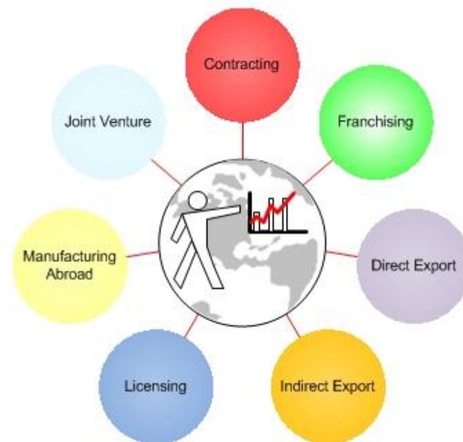
Figure 01: Market Entry Strategies

Further, according to Chung & Enderwick (2001), there are several modes of market entry strategy including direct exporting, foreign direct investment, strategic alliance, licensing and franchising. As illustrated in the below figure 01: